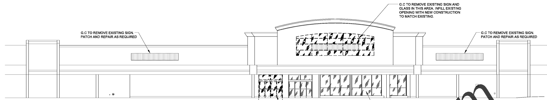
1 DEMOLITION STOREFRONT ELEVATION 1/8" = 1'-0"